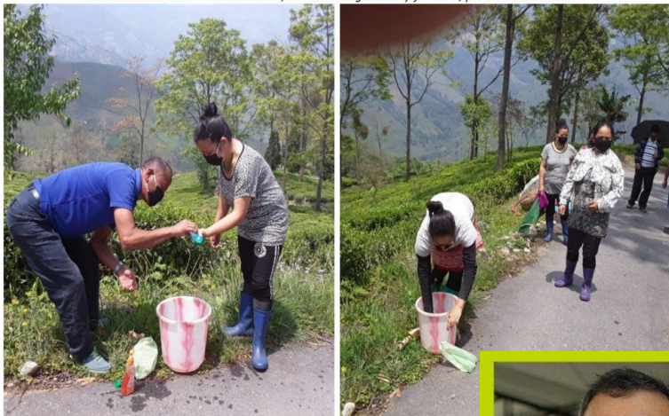
Pic: Workers at Tea Promoters India ; FLO ID 1551 gets ready for work, post the Govt. order